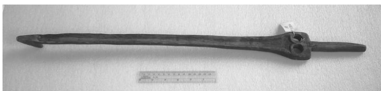
Figure 3. British Museum Aztec atlatl, with full length groove and spur on a ridge, as in some SW atlatls, but with rigid shell or stone loops. From Saville (1925).

Another piece of evidence is the presence of shell or stone finger loops for atlatls in sites in Sonora which are contemporary with the Hohokam and Paquimé (Johnson 1971). Most such finger loops are from central and western Mexico, the most famous specimen being the complete Aztec atlatl (Figure 3) in the British Museum (Eckholm 1962). Johnson believes that little stone stars or crosses also found in Sonoran sites are atlatl decorations or weights. This is based on stylized depictions in Mexican codex art, but there are no atlatls have actually been found with such decoration. Nevertheless, since the shell crosses are found at Paquimé (finger loops are not), Vanpool considers them further evidence of atlatl use there. The occupants of Paquimé would have continued using atlatls along with bows because of their Mexican connections; atlatls are symbolically important in Mexico, being associated with specific deities and with ritual warfare. It is also possible that they hunted bison with them. Further south in Mexico, atlatls were used to hunt waterfowl by the Tarascan groups around Lake Patzcuaro at least into the 1950s (Figure 2), another specialized use with ritual significance (Starr 1901; Stirling 1964).