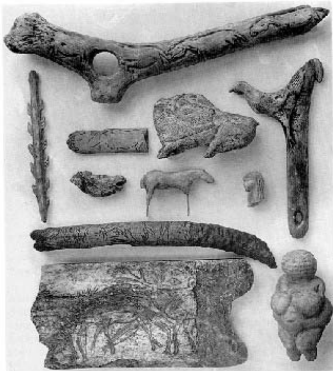
Upper Paleolithic artifacts